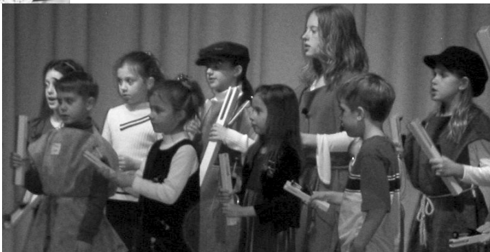
Singers and ringers