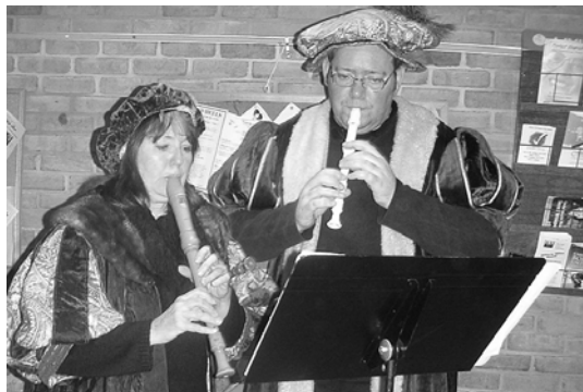
A recorder consort added its festive notes.