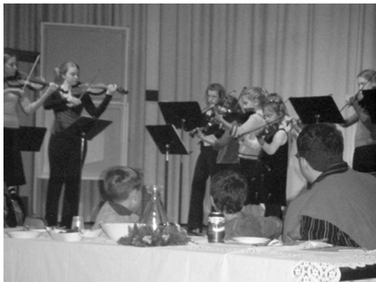
The Suzuki Violins provided dinner music.